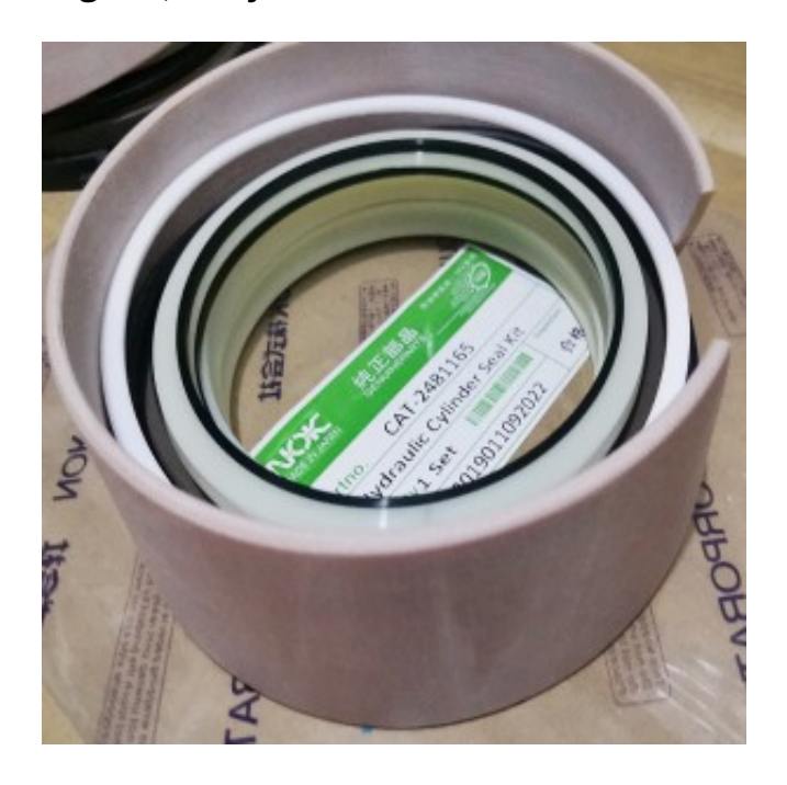
Replacement OEM Seals