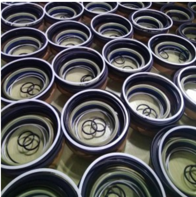
Factory Direct Sales