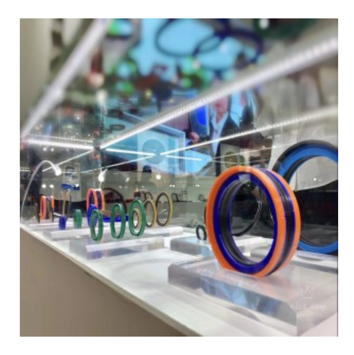
Hight Quality Seals