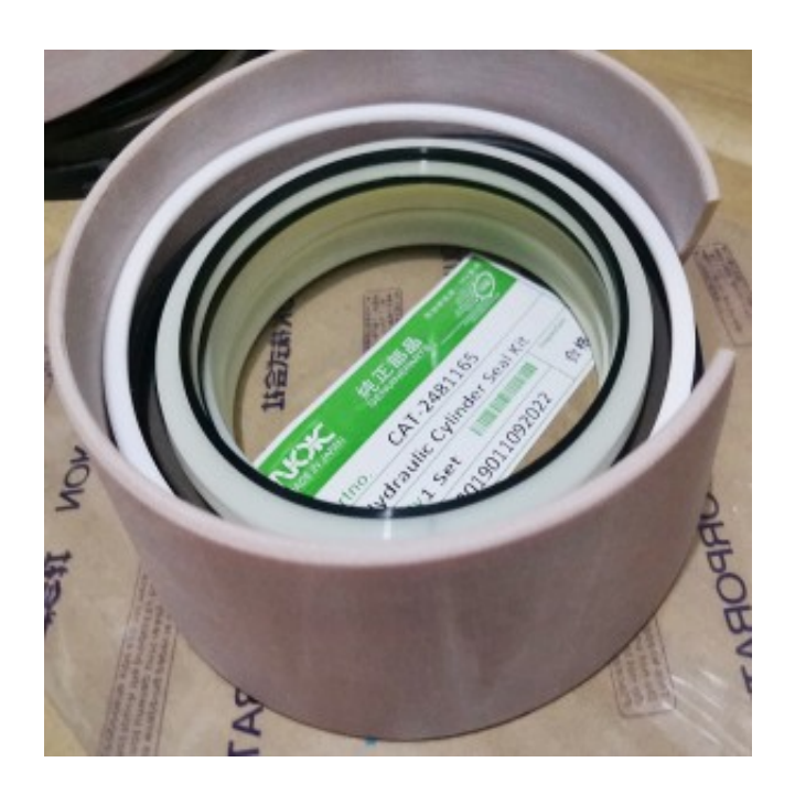
Replacement OEM Seals