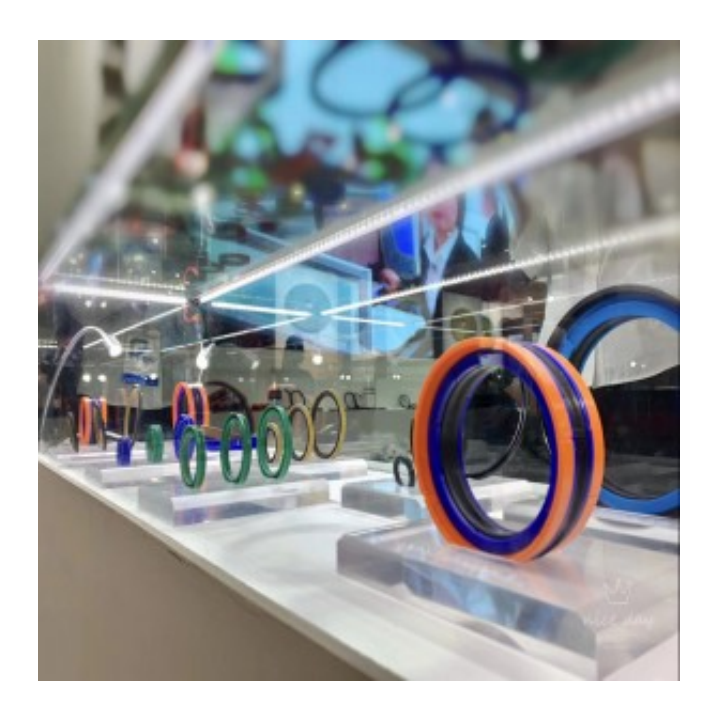
Hight Quality Seals