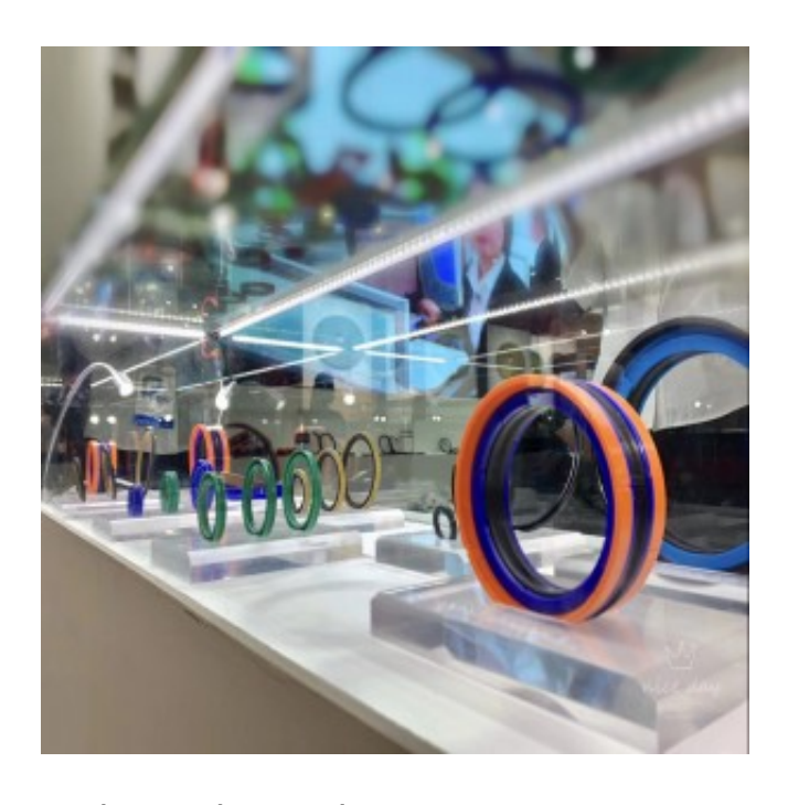
Hight Quality Seals