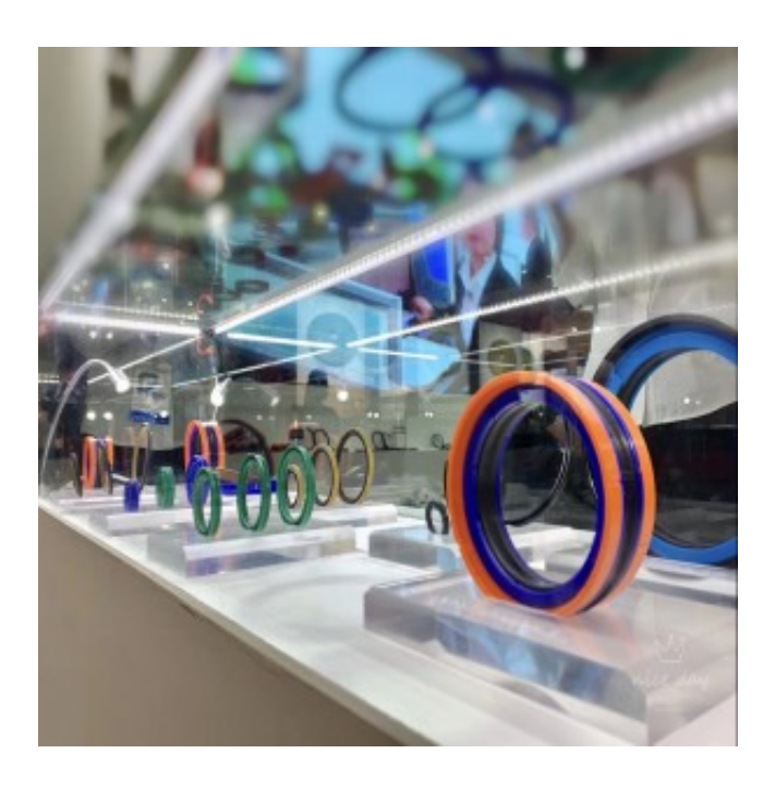
Hight Quality Seals