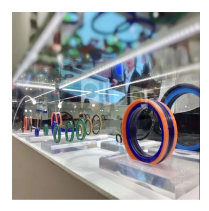
Hight Quality Seals