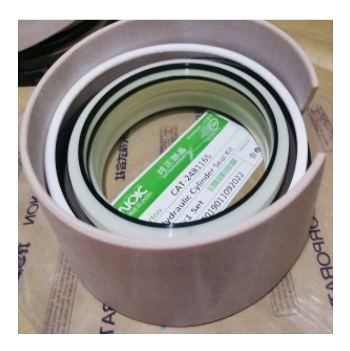
Replacement OEM Seals