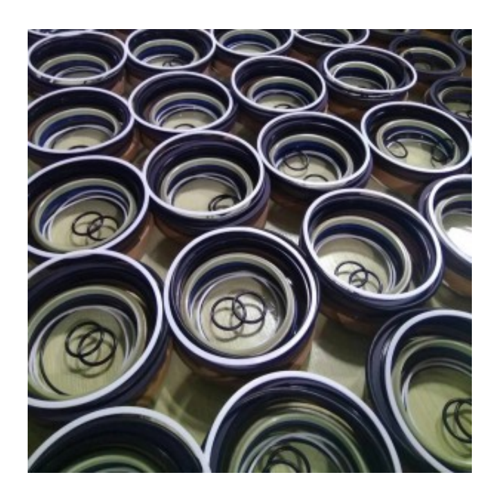
Factory Direct Sales