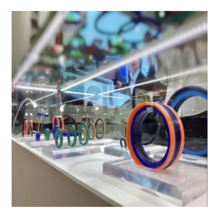
Hight Quality Seals