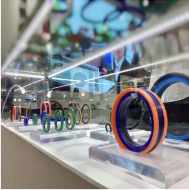
Hight Quality Seals