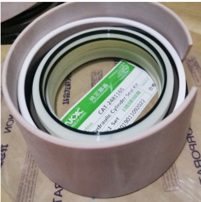
Replacement OEM Seals